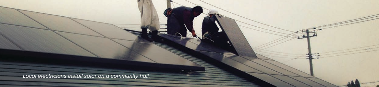
Local electricians install solar on a community hall.

But to get there, and to manage spiraling energy costs into the future, solar plants need to be built. Low costs are not just the product of cheap modules. They come from low cost financing, construction, maintenance and other know-how gained through developing projects.