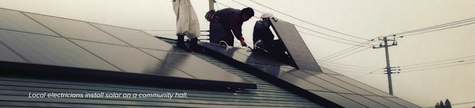
Local electricians install solar on a community hall.

But to get there, and to manage spiraling energy costs into the future, solar plants need to be built. Low costs are not just the product of cheap modules. They come from low cost financing, construction, maintenance and other know-how gained through developing projects.